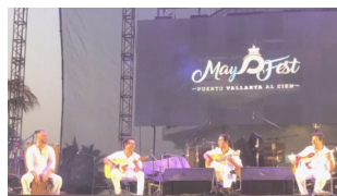
Happy Birthday Puerto Vallarta! 31 May, 2018