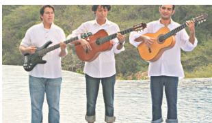
Living In La Cruz 9 March, 2015