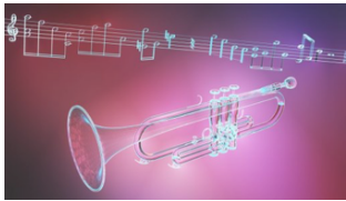
Trumpets and Trapeze 12 March, 2018