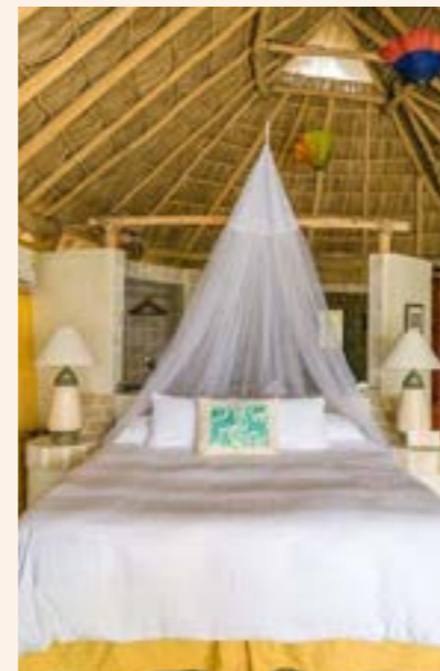
1 bedroom with dual hot tub overlooking the Pacific