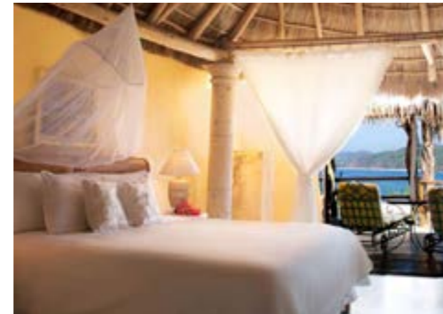
1 bedroom with dual hot tub overlooking the Pacific