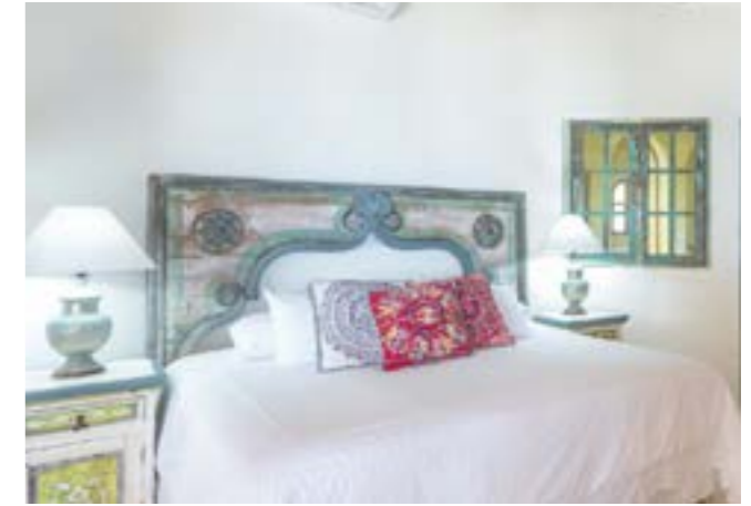
2-bedroom villa with private plunge pool), for events of more than 20 people