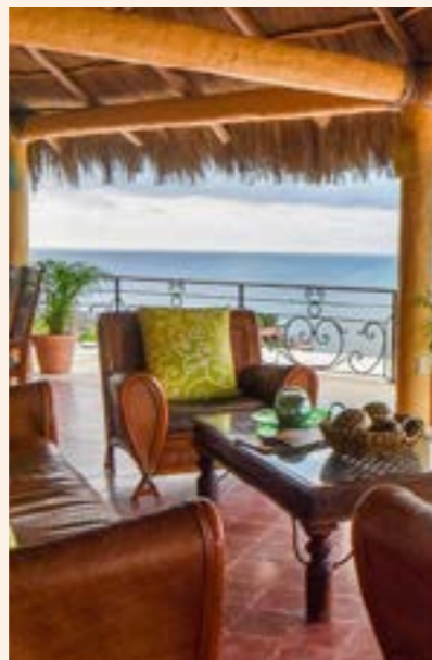
5 bedrooms with the best views in Sayulita